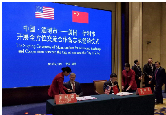
Zhou Lianhua, Secretary of the Communist Party of the China Zibo Municipal Committee, greets Mayor Schember.

“They expressed a lot of interest in medical technology and medical training exchanges,” Groner said. “That’s more challenging because some of that (U.S. medical technology) is proprietary in nature.”