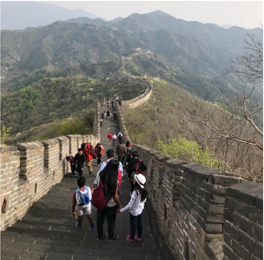
Tourists walk atop the Great Wall.