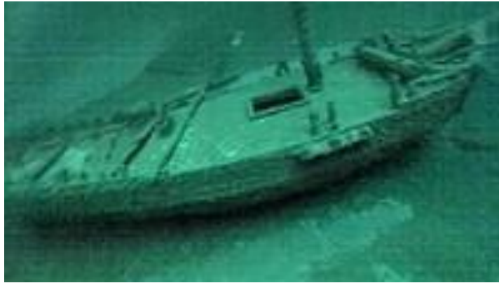
Salina, at the bottom of Lake Ontario