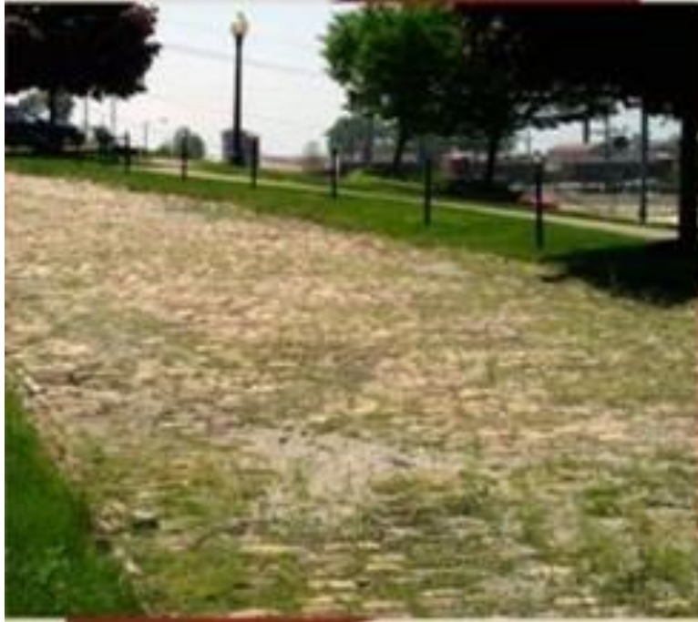
Dobbins Lane, which has been restored, was built of cobblestones.