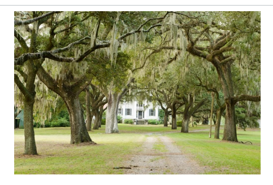
Live oaks line the entry to McLeod Plantation in Virginia